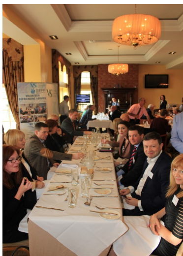
Guests at the seminar enjoying their lunch at the Lough Erne Golf Resort Hotel