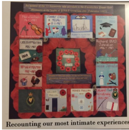
Bereaved Families of Enniskillen