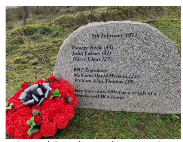
An example Remembrance and Commemorationbased Project

We welcome group bookings for in-person Legacy Trail tours. If interested, please visit our website or contact the office for more information.